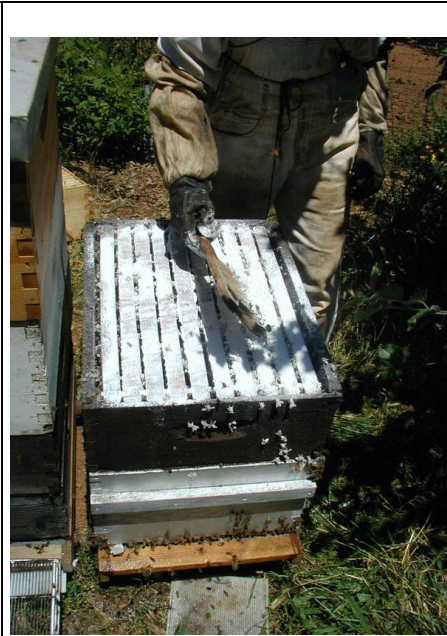
Brushing the sugar between the frames.