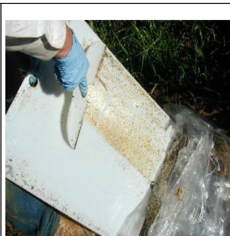
Scraping sugar and mites into a trash bag.