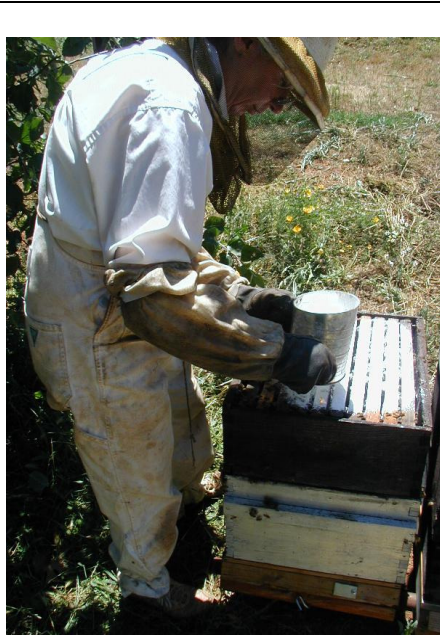
Dusting the sugar over the frames.