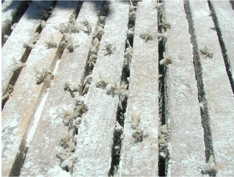
Bees become coated with powdered sugar.